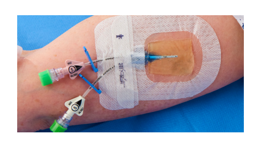
The dressing should be changed if the gel pad remains displaced when pressed with a finger. Change Tegaderm™ CHG Dressings every seven days, when the dressing becomes loose or soiled, if the gel pad is saturated, or in cases where there is swelling, visible drainage, or lost visibility.