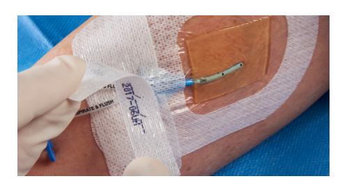
6. Document the dressing change information on the label strip. Apply label strip on top of dressing, over catheter lumen(s). Remove adhesive-free tabs.