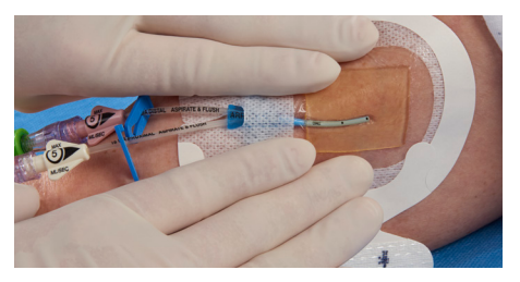
3. Be careful not to stretch the dressing at placement. Apply firm pressure to the entire dressing starting over the gel pad to enhance adhesion.