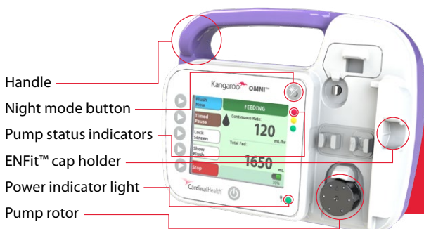
Chart a new course with the Kangaroo OMNI™ Enteral Feeding Pump