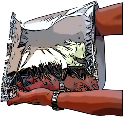
Hand inside the bag