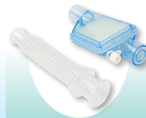
Hygroscopic Condenser Humidifier HMEF 1500

ADULT TIDAL VOLUME 250-1500 mL RESISTANCE at flow 30 L/min 0.8 cm H 2 O at flow 60 L/min 1.8 cm H 2 O DEAD SPACE 60 mL MOISTURE OUTPUT 250 mL 35.3 mg H 2 O/L 500 mL 31.3 mg H 2 O/L 1000 mL 30.4 mg H 2 O/L FILTRATION EFFICIENCY Bacterial: >99.999% Viral: >99.99% WEIGHT 36 g CONNECTIONS 22M/15F-22F/15M PACKAGE QUANTITY 25/Case