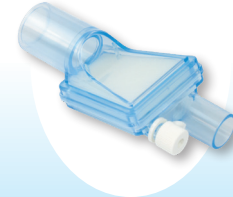
Hygroscopic Condenser Humidifier HMEF 600

ADULT TIDAL VOLUME 250-1500 mL RESISTANCE at flow 30 L/min 0.9 cm H 2 O at flow 60 L/min 2.0 cm H 2 O DEAD SPACE 89 (60) mL MOISTURE OUTPUT 250 mL 37.3 mg H 2 O/L 500 mL 33.3 mg H 2 O/L 1000 mL 31.3 mg H 2 O/L FILTRATION EFFICIENCY Bacterial: >99.999% Viral: >99.99% WEIGHT 45 g CONNECTIONS 15F-22F/15M PACKAGE QUANTITY 25/Case