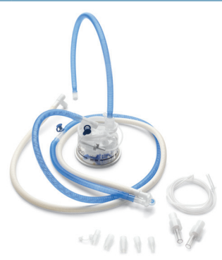
RT265 Fisher & Paykel infant dual limb (1141548)