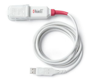
External pulse oximeter (Masimo USB cable) (1145408)