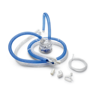
RT211 adult dual limb heated circuit kit (1141427)