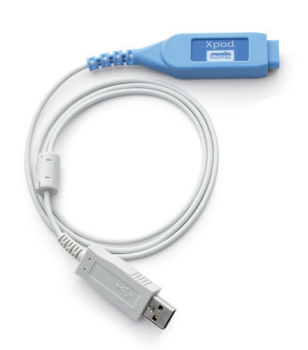
External pulse oximeter (Nonin XPOD - USB cable) (1129640)