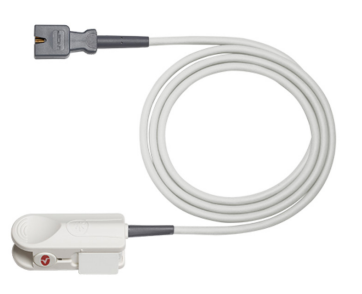
Re-usable adult finger clip SpO<sub>2</sub> sensor (Masimo) (1081984)