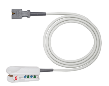
Re-usable ped finger clip SpO<sub>2</sub> sensor (Masimo) (1072878)