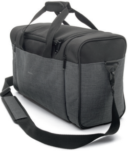
Trilogy Evo travel bag (1134428)