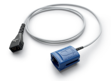
Re-usable adult SpO<sub>2</sub> sensor (Nonin) - pediatric (936P), adult (936)