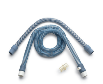
Fisher & Paykel 900MR810 reusable circuit (1141549)