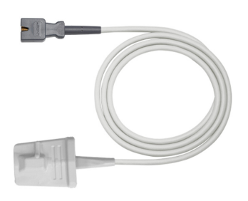
Re-usable adult soft SpO<sub>2</sub> sensor (Masimo) (1081516)