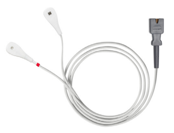
Re-usable multisite SpO_2 sensor (Masimo) (1081985)