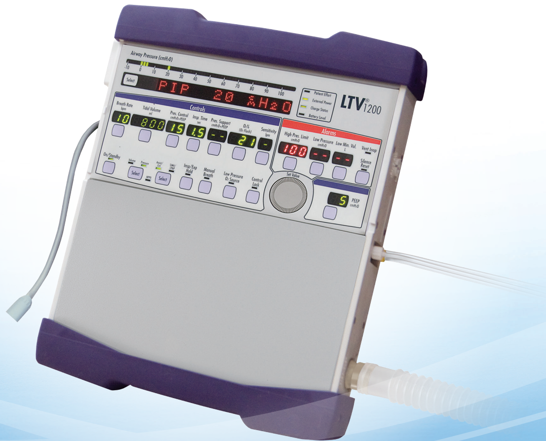
LTV™ 1200 portable ventilator